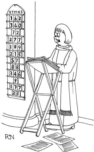
The need for a loo became more pressing